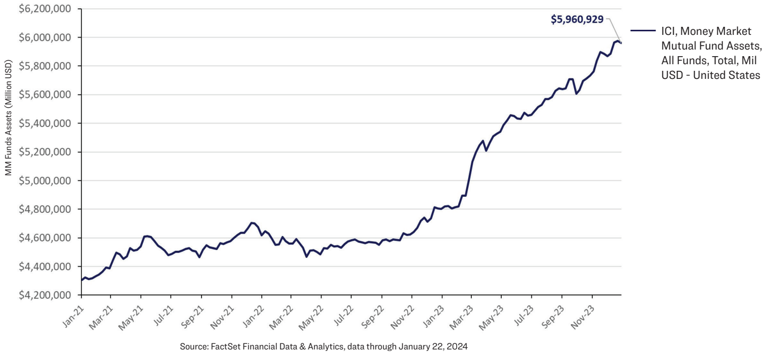
Figure 3 A record amount of cash is currently in U.S. money market funds

Based on individual financial situations, investors with excess cash and longer time horizons may consider U.S. equities, especially as volatility picks up and as we go through this reset period for inflation, corporate profits and monetary policy.